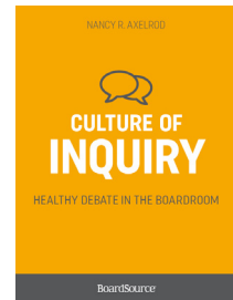
Culture of Inquiry