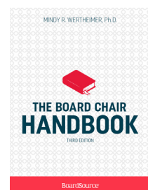
The Board Chair Handbook